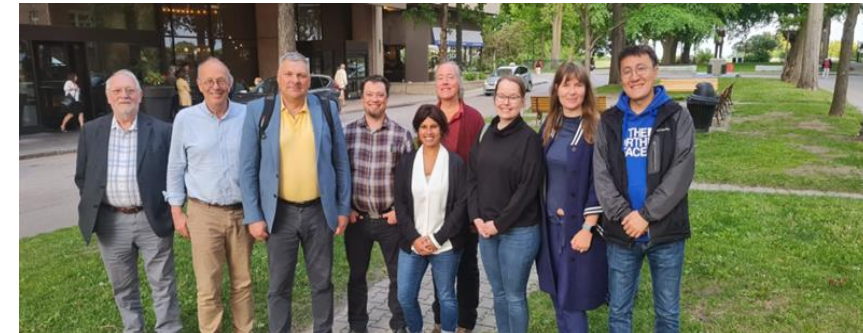
The previous EB of the IPS